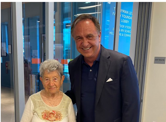
Meeting with one of the many Holocaust Survivors who have found community at the Gunther-Hirsch Center.