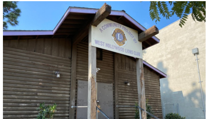
The Log Cabin Recovery Center, an historic building that's been a symbol of hope for many facing addiction issues.