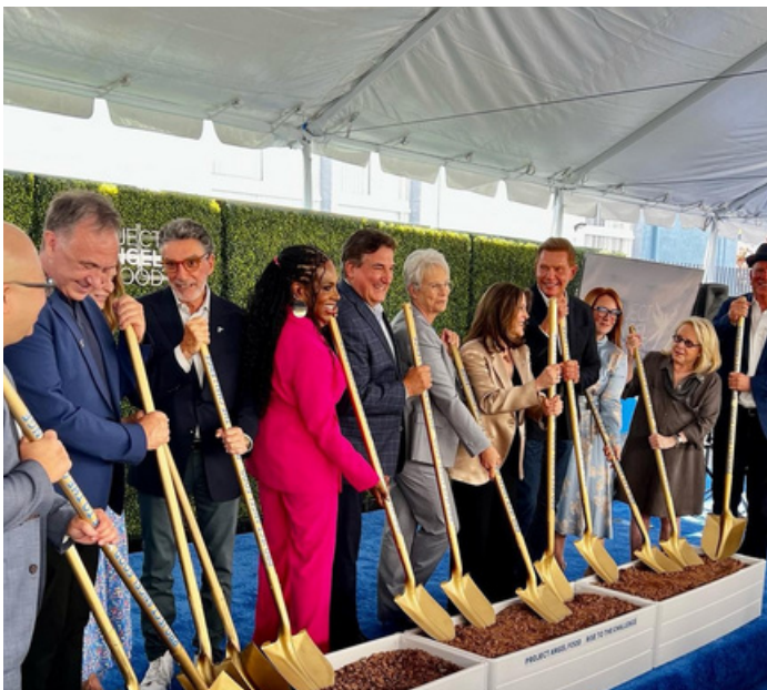
Marking the construction of a brand new building for Project Angel Food.