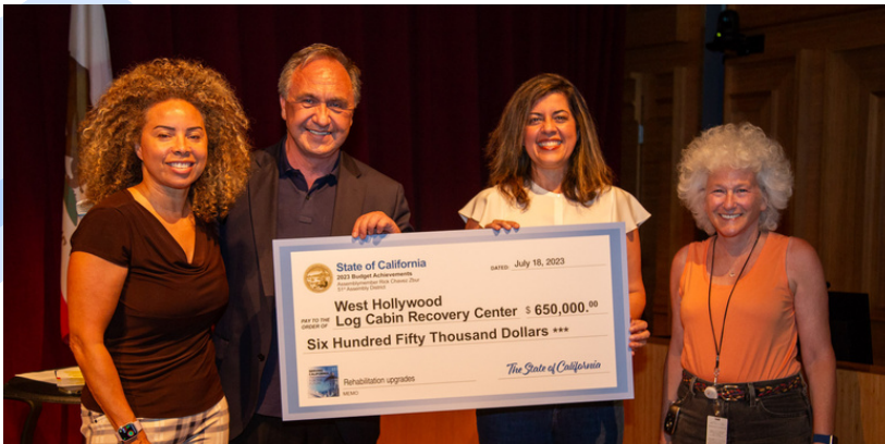
Standing with West Hollywood Mayor Sepi Shyne to Present a Check for $650,000 to the Log Cabin Recovery Center

I am proud to have secured funding for a number of non-profits that are providing important services to our community. Along with Sen. Ben Allen, $1.15 Million was secured for The West Hollywood Log Cabin Recovery Center, an historic building that's been a symbol of hope for many facing addiction issues. I also secured $500,000 for Project Angel Food, which delivers more than one million meals a year to people with serious illnesses.