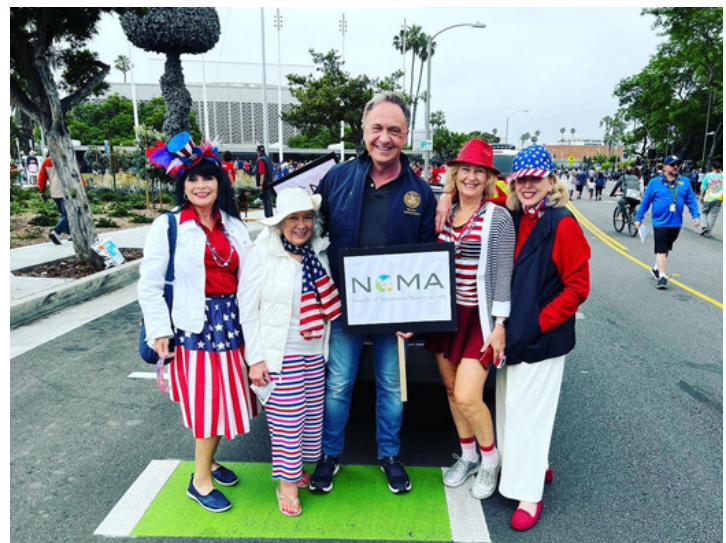
Meeting with NOMA (North of Montana Association) to learn more about their efforts in Santa Monica.