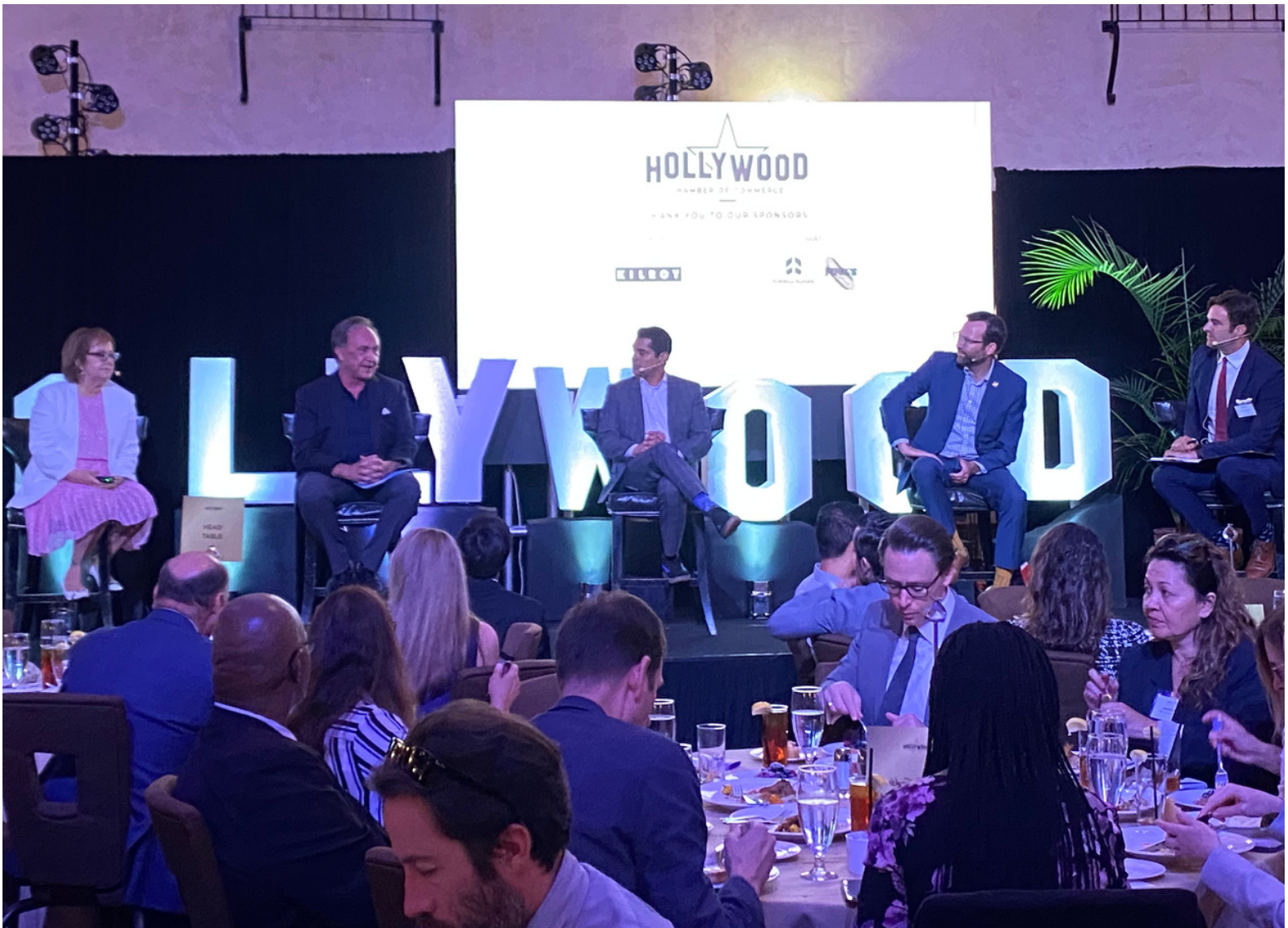
Discussing pressing issues on a panel with Hollywood's Chamber of Commerce.

Small businesses and their owners play a crucial role in building vibrant and thriving communities. They contribute to local economies by generating jobs, fostering entrepreneurship, and driving innovation. Small businesses are the heart and soul of our communities. I've met with the Santa Monica, Hollywood and West Hollywood Chambers of Commerce in the last few months to learn about the unique challenges faced in each community.