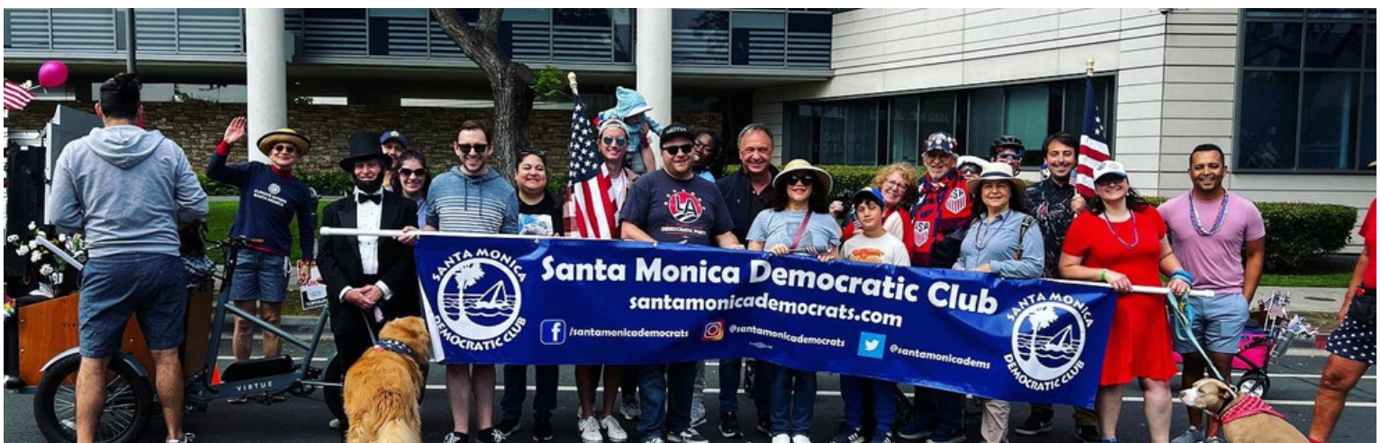
Chatting with Santa Monica Democratic Club members (both two-legged and four-legged).