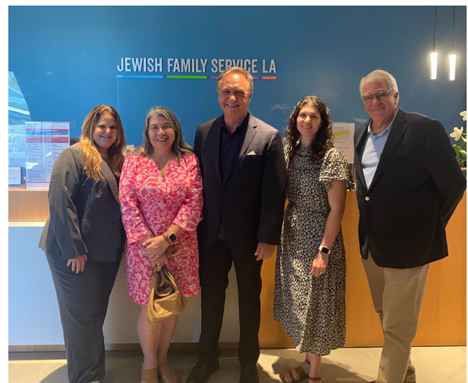
Touring Jewish Family Services LA's Gunther-Hirsch Center.