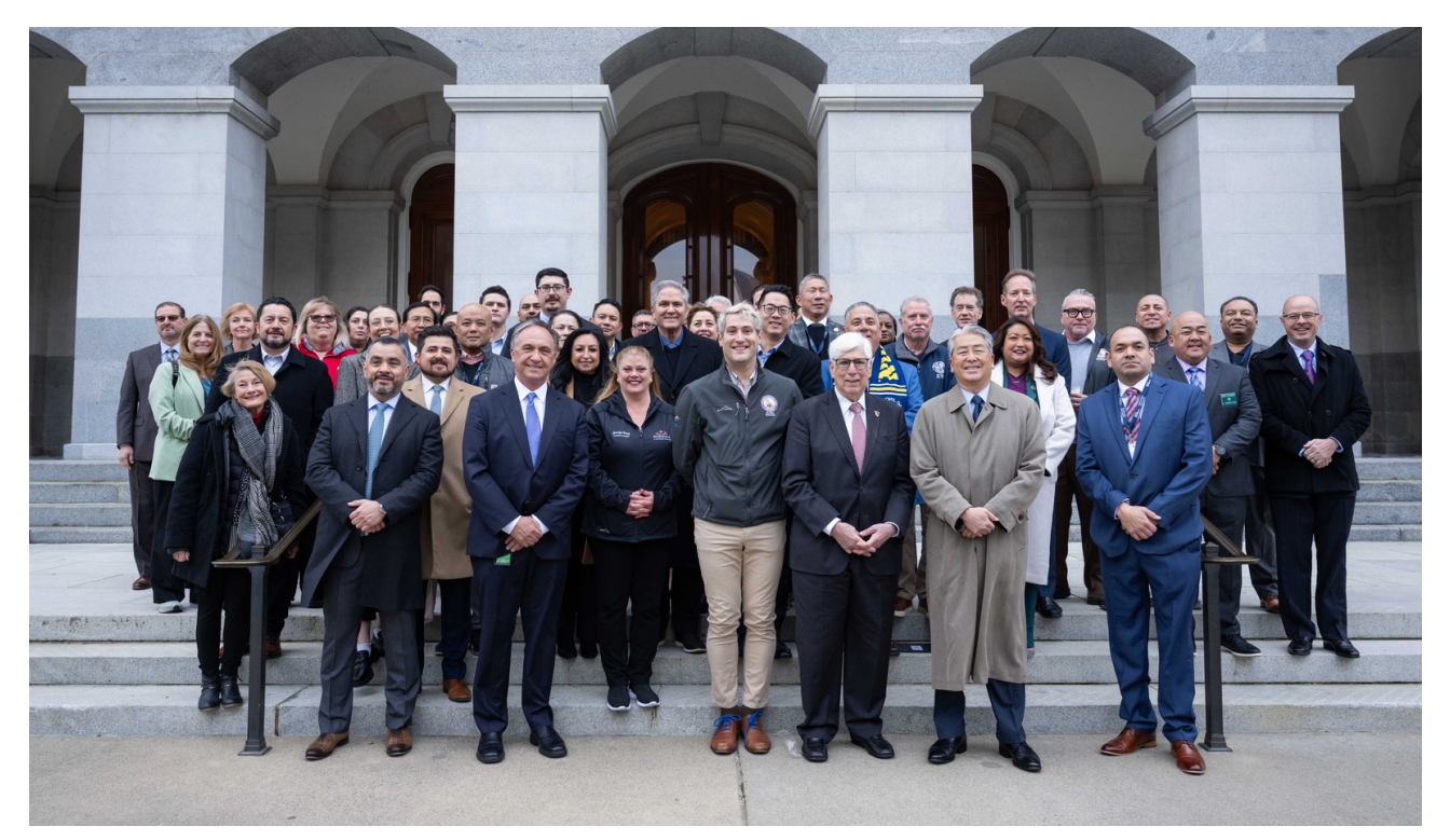
Legislators and California city leaders at the West Steps of the California State Capitol.